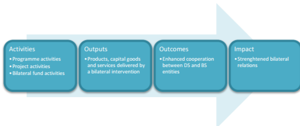
Figure 1 Results chain for bilateral cooperation

Bilateral cooperation is facilitated and supported by the EEA and Norway Grants through programmes, projects and bilateral fund activities.